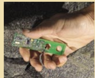
Tag is installed in cap lamp battery case for personnel and mounted in rugged enclosure for vehicle applications.