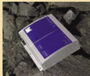
Reader has four antennae ports to reduce number of readers and provide directionality.

Smart Tag will be tailored to meet your company's specific requirements. Our team of software and hardware experts will support you in the implementation and the maintenance of the Smart Tag system. Software licences of up to three years can be purchased to keep your site up to date with all product enhancements.