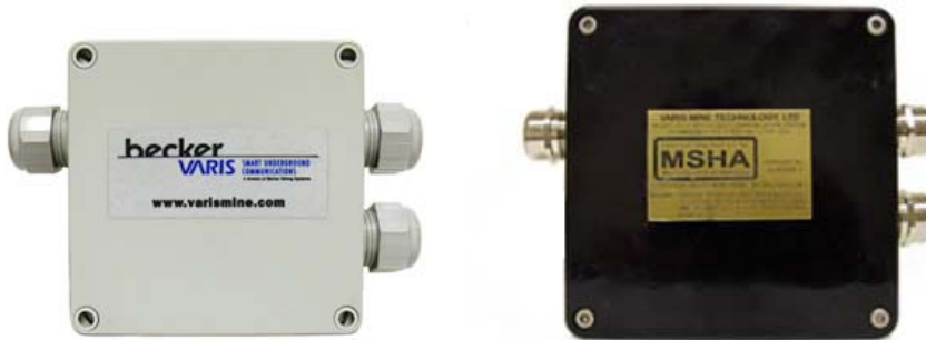
RNG-SP2 (left), RIS-SP2 (right)