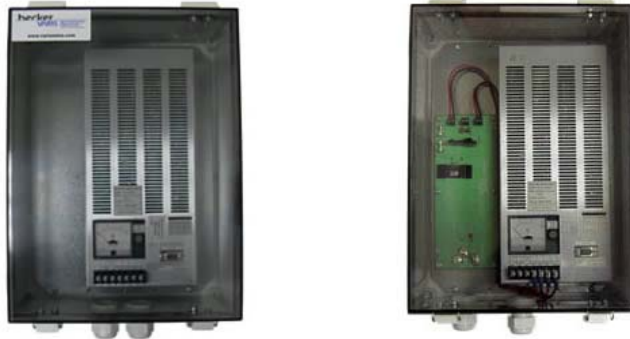
RNG-DC16 (left), RNG-DC36 (right)

Varis' Smart Com 150 DC Power Supplies utilize a DC-DC converter to achieve constant voltage output, regardless of AC (or battery) supply conditions. This keeps the Leaky Feeder line voltage constant during power swings or battery backup. Each Power Supply includes diagnostic LEDS and an ammeter to provide indication of unit status.