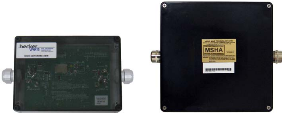
RNG-AMP (left), RIS-AMP (right)

Varis' Smart Com 150 and Smart Com 150IS Line Amplifiers compensate for Leaky Feeder cable and splitting losses. Varis 150 Line Amplifiers provide 16 simultaneous noise-free voice radio channels (no third order intermodulation products) and a 54 Mbps downstream, 41 Mbps upstream Ethernet connection using standard cable modems. Local/Remote Diagnostics, Ethernet, video and accurate Automatic Gain Control (AGC) without Return Pilot noise buildup are built-in to every amplifier. Smart Com 150/150IS line amplifiers have proven 500 m spacing, with over 1000 km installed since 1997.